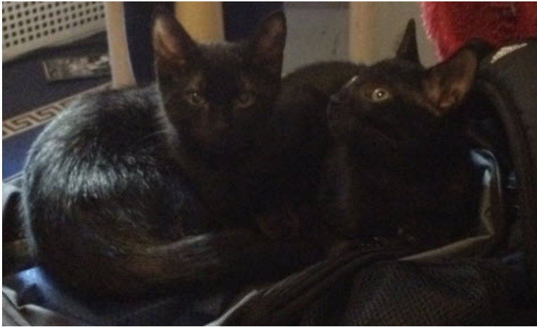
Flash & Batman - ready for action and adventure!