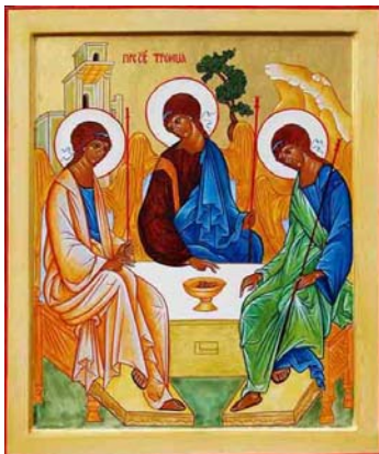
Icon of the Trinity, after Anton Rublev (15 th C)

TUESDAY EVENSONG by our Junior Choristers completed the 2013-2014 Season this week. Bravo Choristers on a beautiful season!