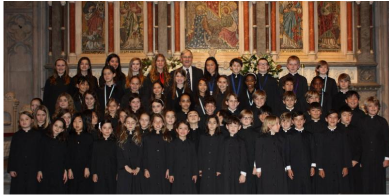
Junior Boy and Girl Choristers 2014-2015