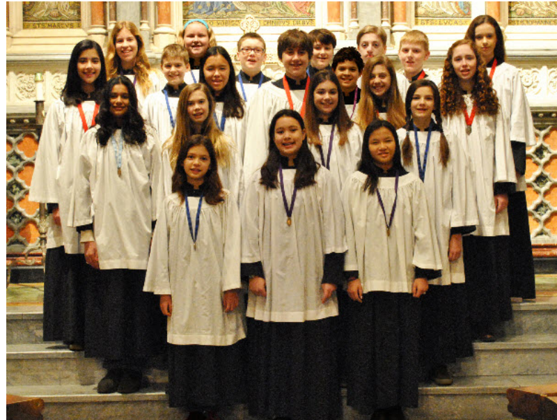
Senior Boy and Girl Choristers 2014-2015

as fine wines, iPads and also child friendly items. This fund supports activities and opportunities for the choirs that are not covered by the annual budget including such projects as the upcoming tour this summer to France. Tickets are $5 and $10. Winners will be selected today at the parish picnic! Thank you for all your prayers and support.