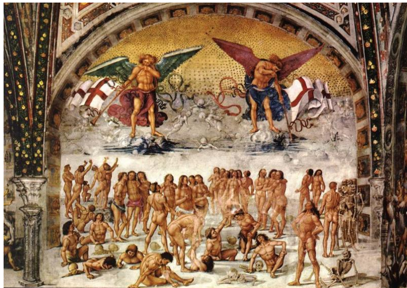
Resurrection of the Flesh (c. 1500) by Luca Signorelli – based on 1 Corinthians 15: 52: "the trumpet shall sound, and the dead shall be

THE SUNDAY FORUM is on recess for the summer. Plans for the fall season, which launches on Sept 13, include a study of the books of Corinthians I and II – from scripture and historical context to issues for the contemporary church. These books are rich with topics for exploration such as the Corinthian people, Corinth as the crossroads of the Greco–Roman world, the Resurrection and life after death, women in the church, Christian–Jewish relations and more. Watch this space for details, and then plan to come to the Sunday Forum each week at 10 am in the Reception Room for coffee, lively discussion and spiritual enrichment!