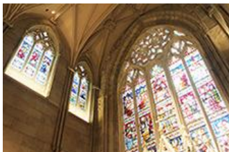
"Strengthening Our Presence, Securing Our Future."