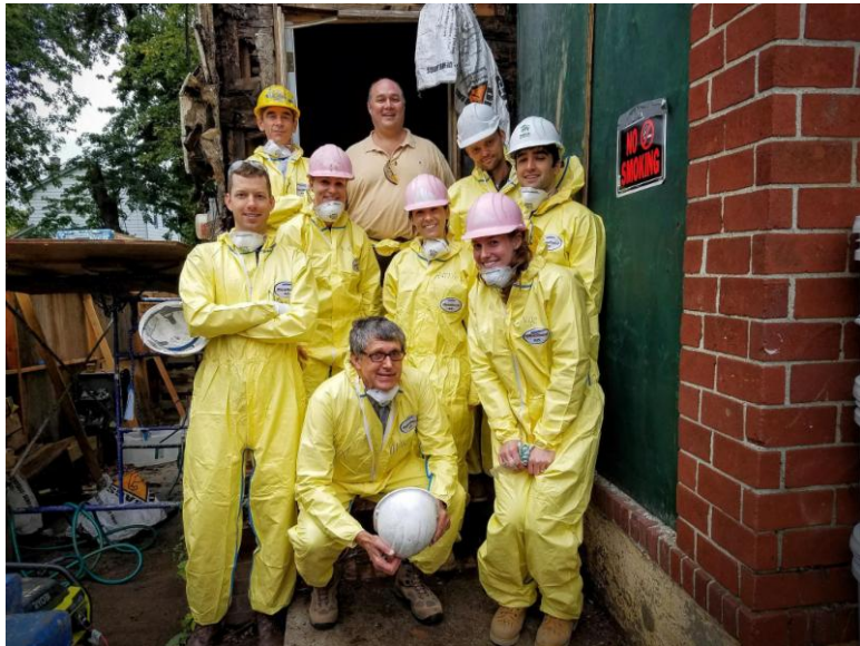
See those smiles?

TOMORROW, SAT, OCT 15 THE HOUSE THAT GRACE BUILT A FEW MORE HELPERS ARE NEEDED!