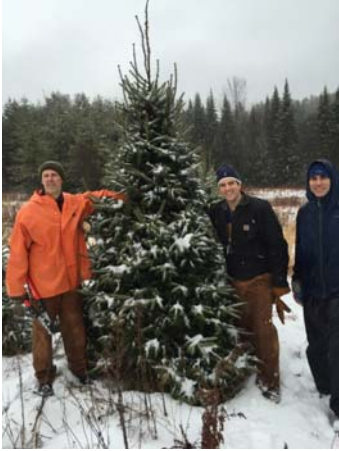
At the DiDomenico Tree Farm!