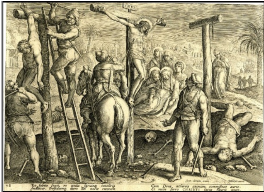
_Passio_ mors et resurrectio dn. Nostri Jesu Christi._ Longinus Stabbing Christ with his Lance.

(Service times for GOOD FRIDAY and HOLY SATURDAY, visit our website HERE. )