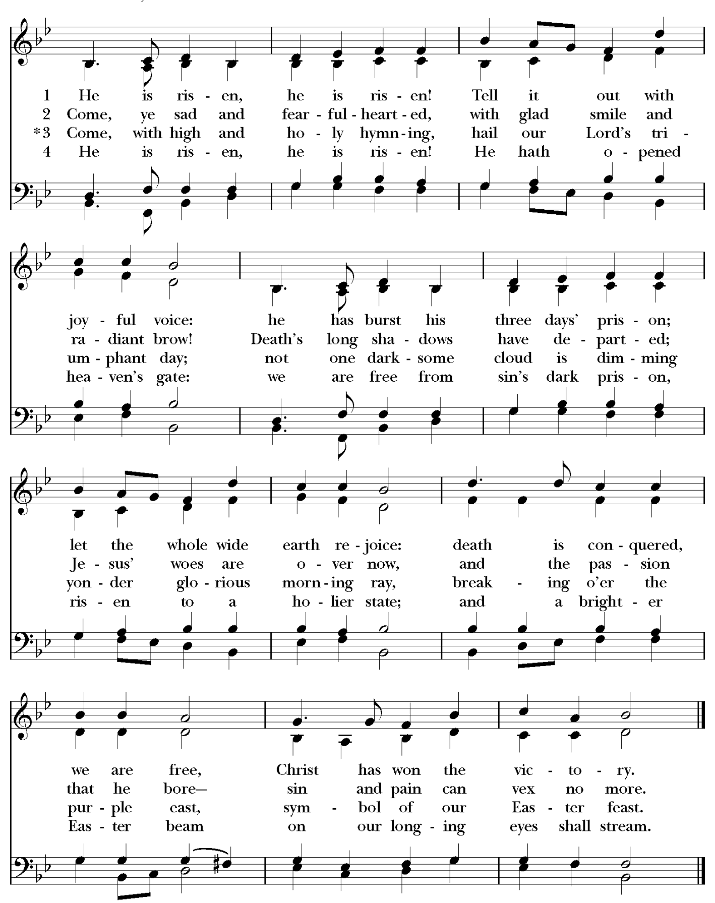
HYMN 180 He is risen, he is risen!