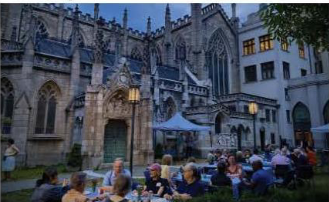
Parishioners enjoy fellowship during a summer evening cookout on Huntington Close

† Coffee Hour offers a time for parishioners to connect after worship.